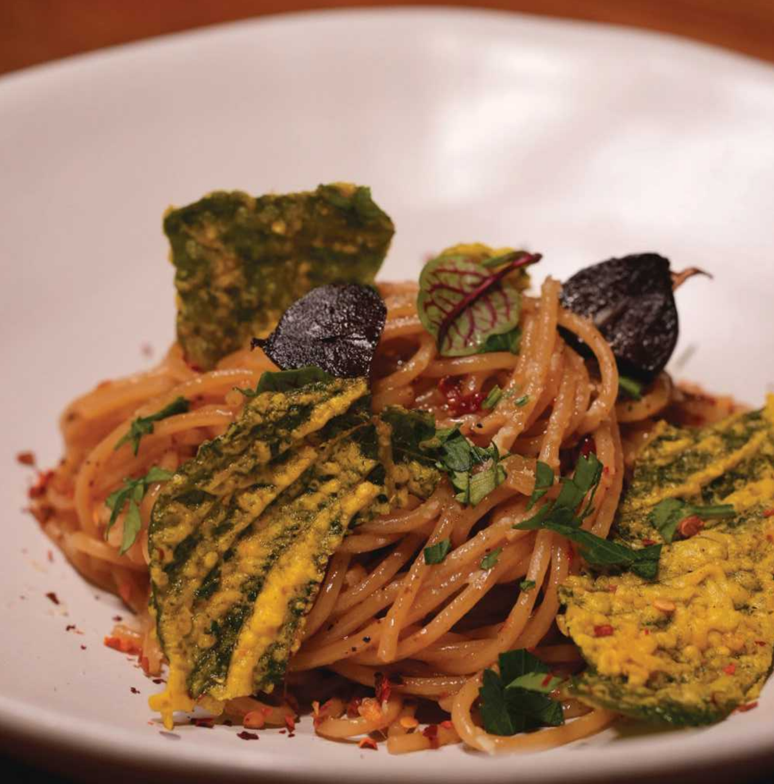
Spaghetti Black Garlic & Olive Oil