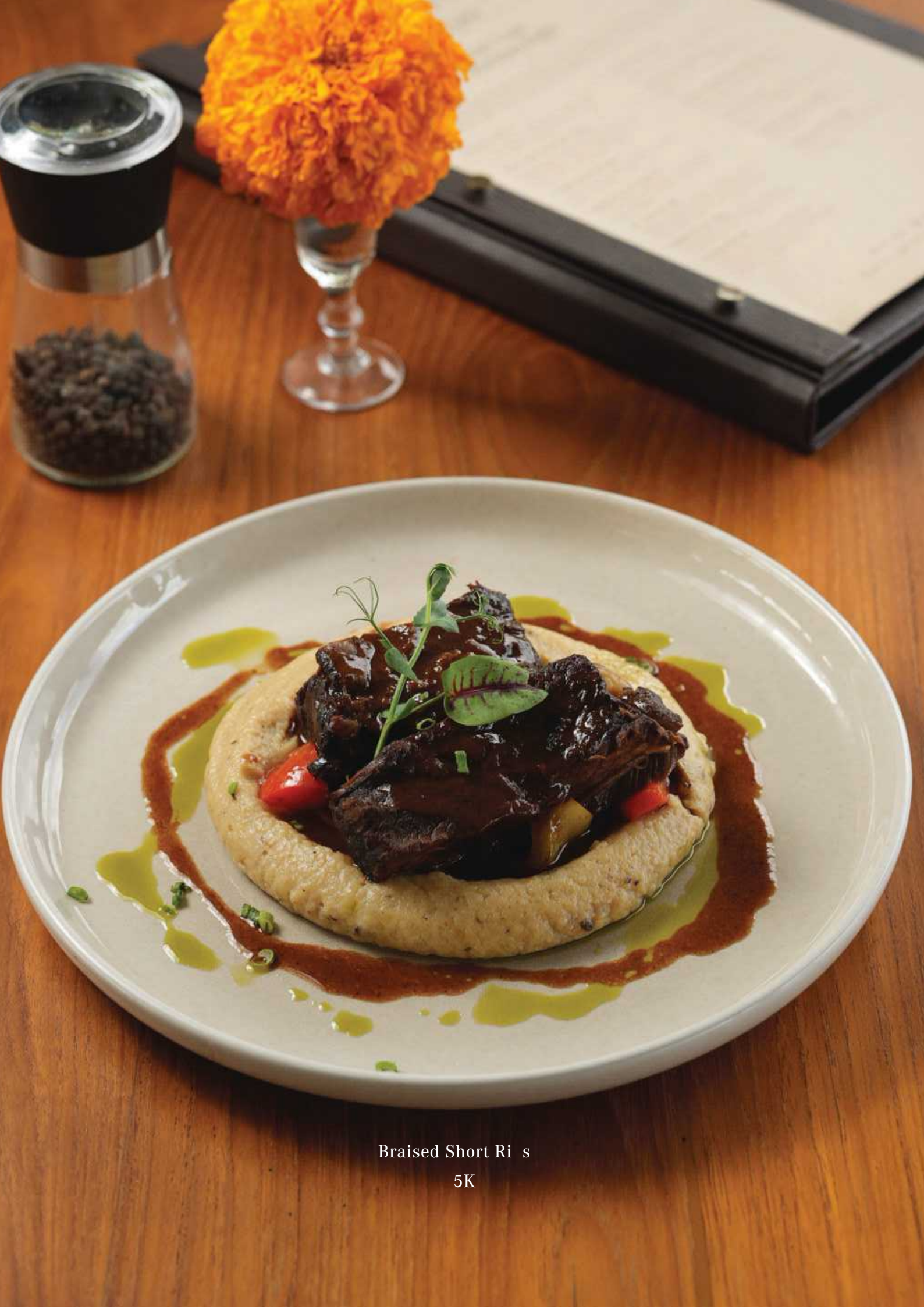
Braised Short Ribs