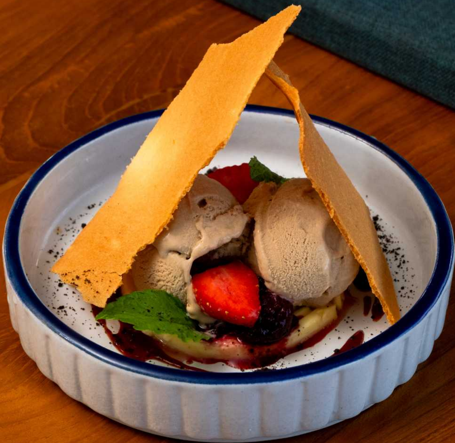
Black Garlic Sweet 79K